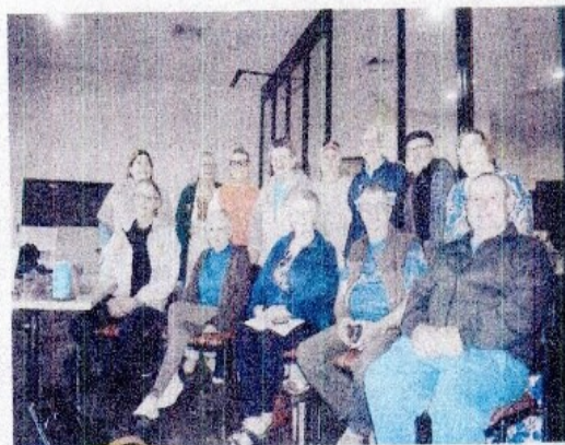
Gatton Lapidary Club at the Colonial Cafe.